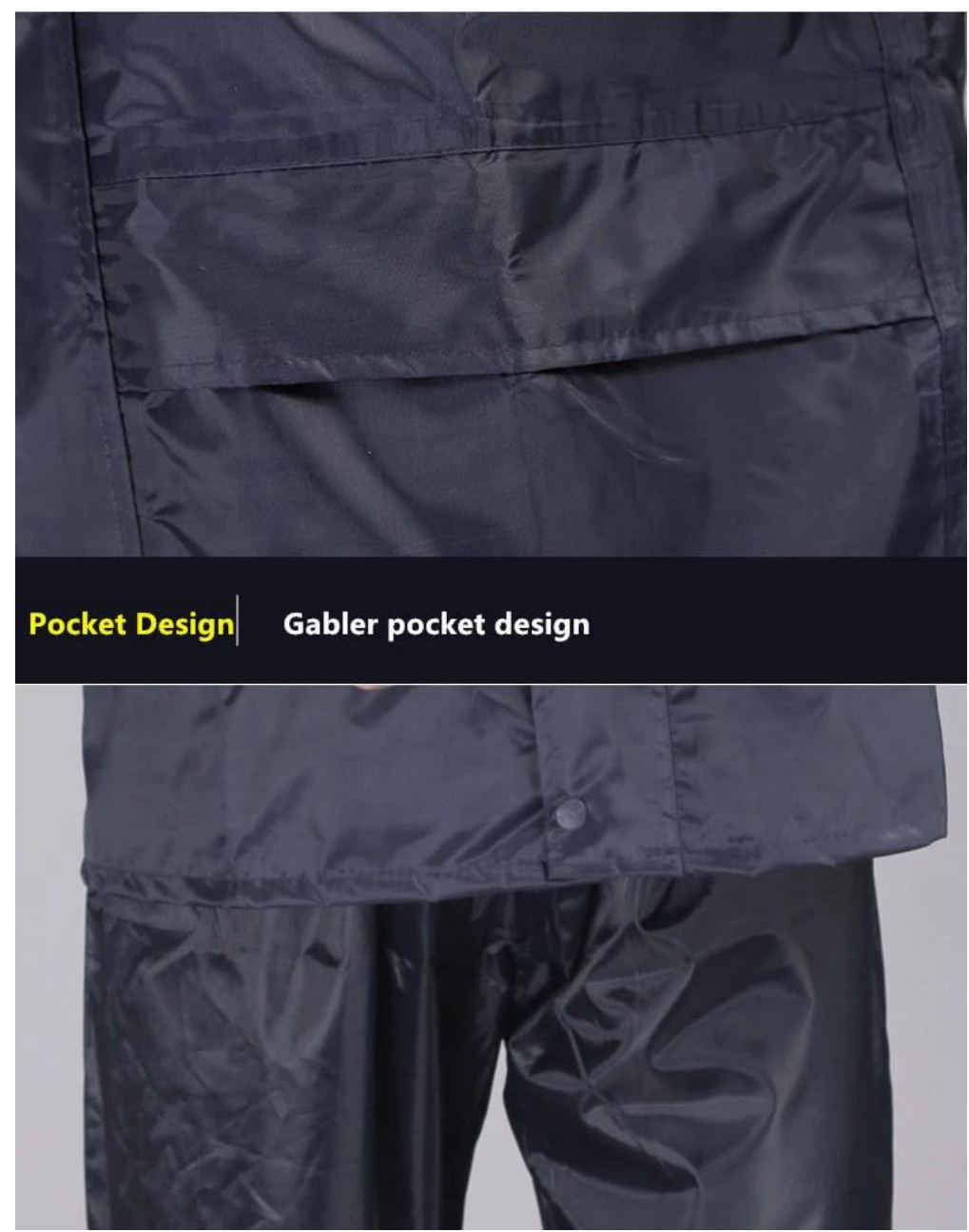
Any needs welcome to contact us for samples!