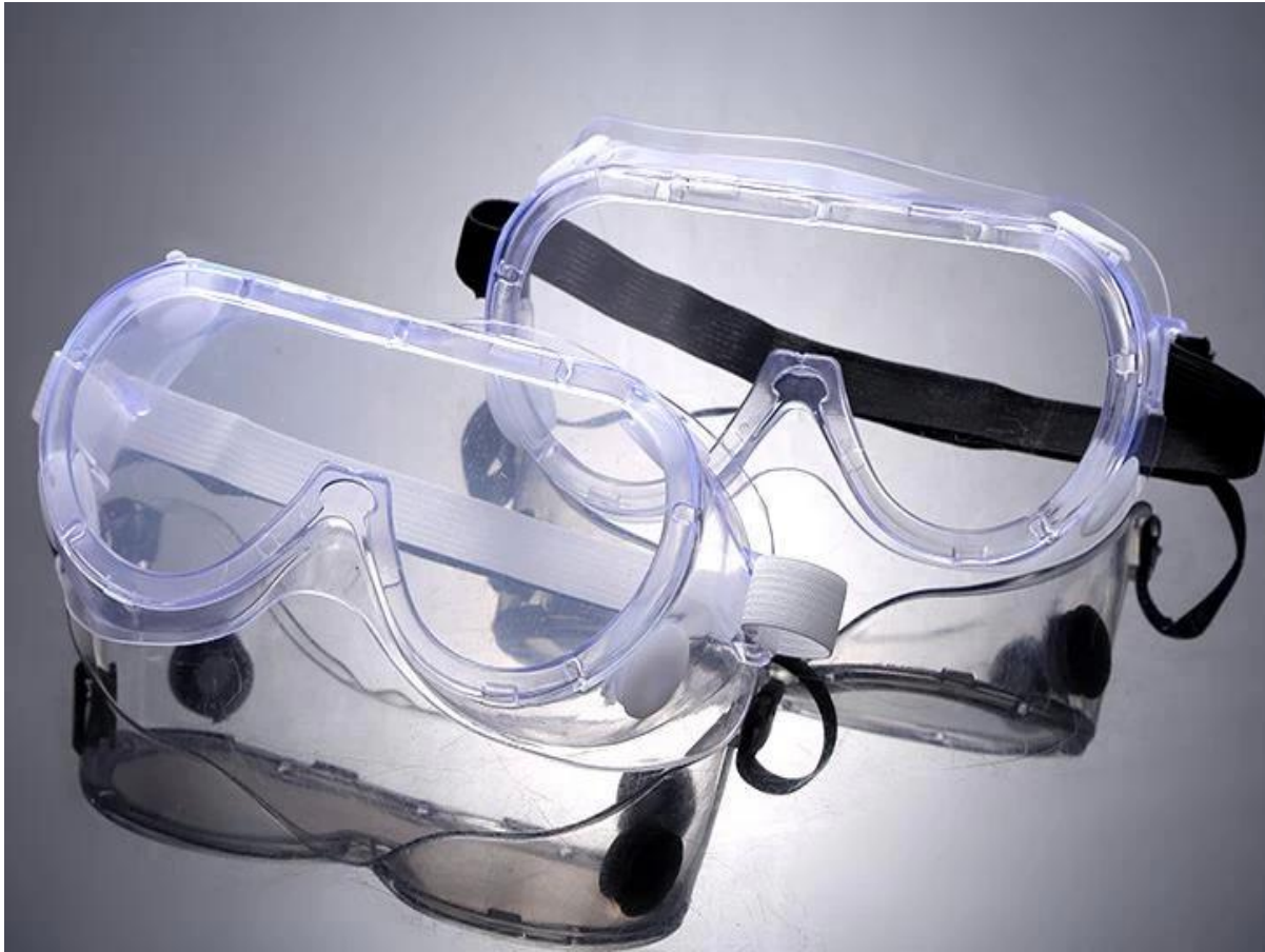
Factory Wholesale Anti Virus PVC Protective Glasses Goggles Medical Safety Glasses