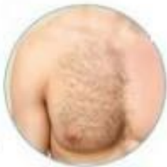
Thoracic and bristles hair